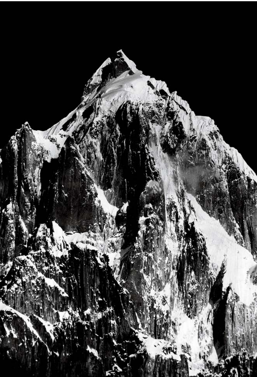
[This Page] A telephoto image of Paiju (6610m) taken from the Liligo Glacier. The mountain's name (the Balti word for salt) derives from deposits near its base. Legend claims that at one time locals believed that the summit glacier was made from salt. Ventura's modern photo demonstrates that the mountain's hanging glaciers are now either deteriorating or have already disappeared completely.