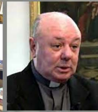
Documents shooting and the active interview examples