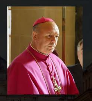
Monsignor Sergio Pagano, Prefect of the Vatican Archives